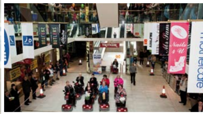
Scooter flashmob at ShopMobility launch, Feb '11

ShopMobility is about the freedom to get around, for everyone. It is a scheme which lends out mobility equipment to members of the public, who have limited mobility, in order for them to visit shops and leisure facilities.