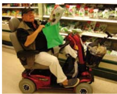
ShopMobility gives me a new sense of freedom.

ShopMobility is for anyone who needs help with mobility. They can be young or old and it doesn't matter if they are permanently or temporarily disabled or injured. Able bodied people can also use ShopMobility to borrow equipment for the use of their family members.